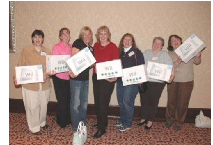
Happy winners of the Nintendo Wii Game System