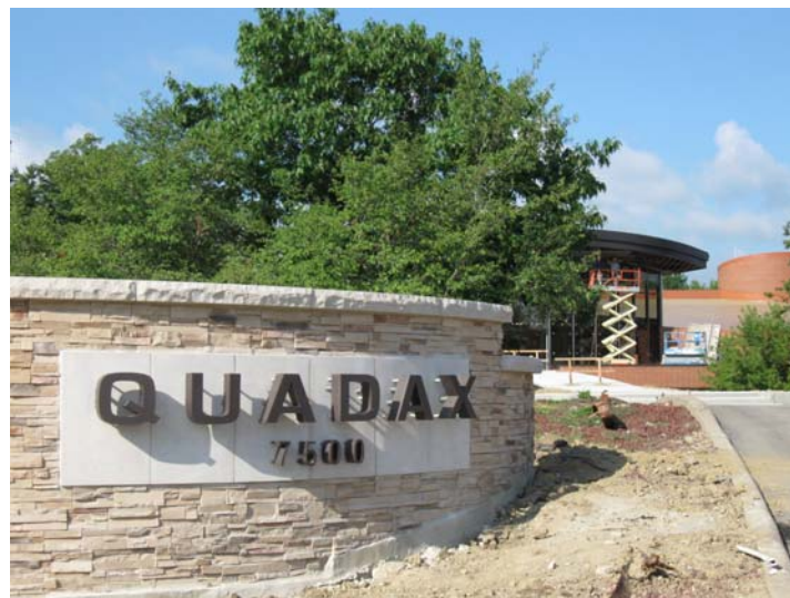
The main entrance at 7500 Old Oak Boulevard