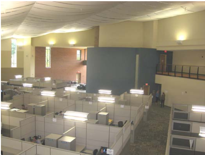
A view of some of the office space on the first floor

The weekend of the move (July 25-27), Quadax Network Services staff worked long hours installing PCs, phones, and more to ensure business continuity. Though there were boxes to be unpacked on our first morning here, it did not take most people very long to settle in and get right back to work. In fact, on our first day here, Monday July 28, 129 support calls were handled by our EDI Client Support Center and HARP Help Desk, and 37 payer transmissions were conducted successfully.