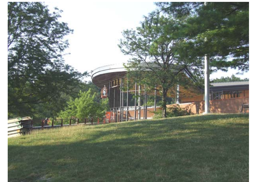
Transformation of the visitor’s entrance at the front of the building is still underway.