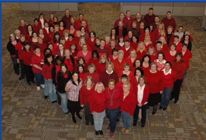
Quadax employees showed their support for the fight against heart disease by wearing the color red on National Wear Red Day.

Q uadax not only cares deeply about service to our clients, but also about service to our communities. This past year the company sponsored an Outreach Committee, to focus our efforts on what we can do to help those in need, as well as a Wellness Committee, to focus on the health and well-being of our employees, who are key to the Quadax service. The following are some of the projects our staff is participating in to help make our communities better.